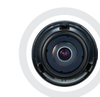
2.4mm LENS MODULE SLA-2M2400Q