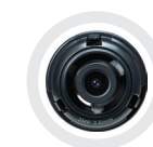
3.6mm LENS MODULE SLA-2M3600Q