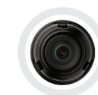
3.7mm LENS MODULE SLA-5M3700Q