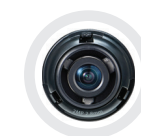
2.8mm LENS MODULE SLA-2M2800Q